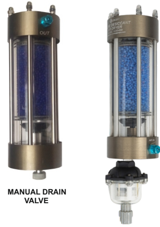
MANUAL DRAIN VALVE

The compressed air flow through the bottom of the dryer and distributed uniformly and passed through the desiccant bed. The moisture is drained at the bottom either with manual drain or automatic drain valve (optional).