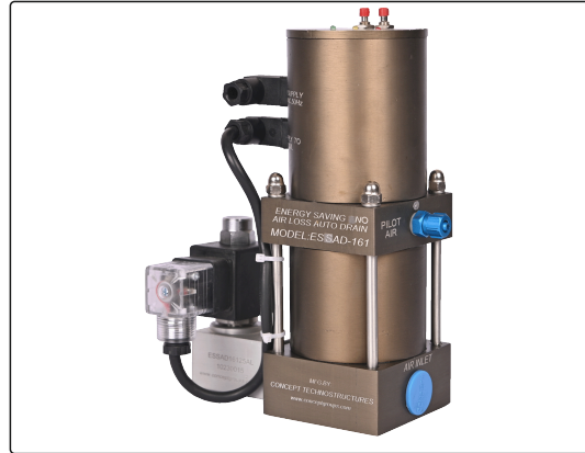
Model - ESSAD-161